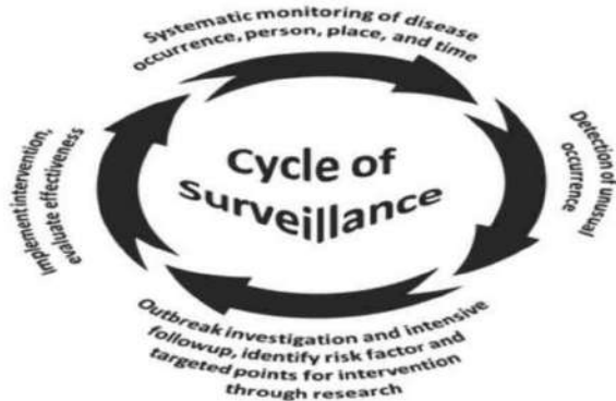
Fig 3: The surveillance cycle for investigating infectious diseases